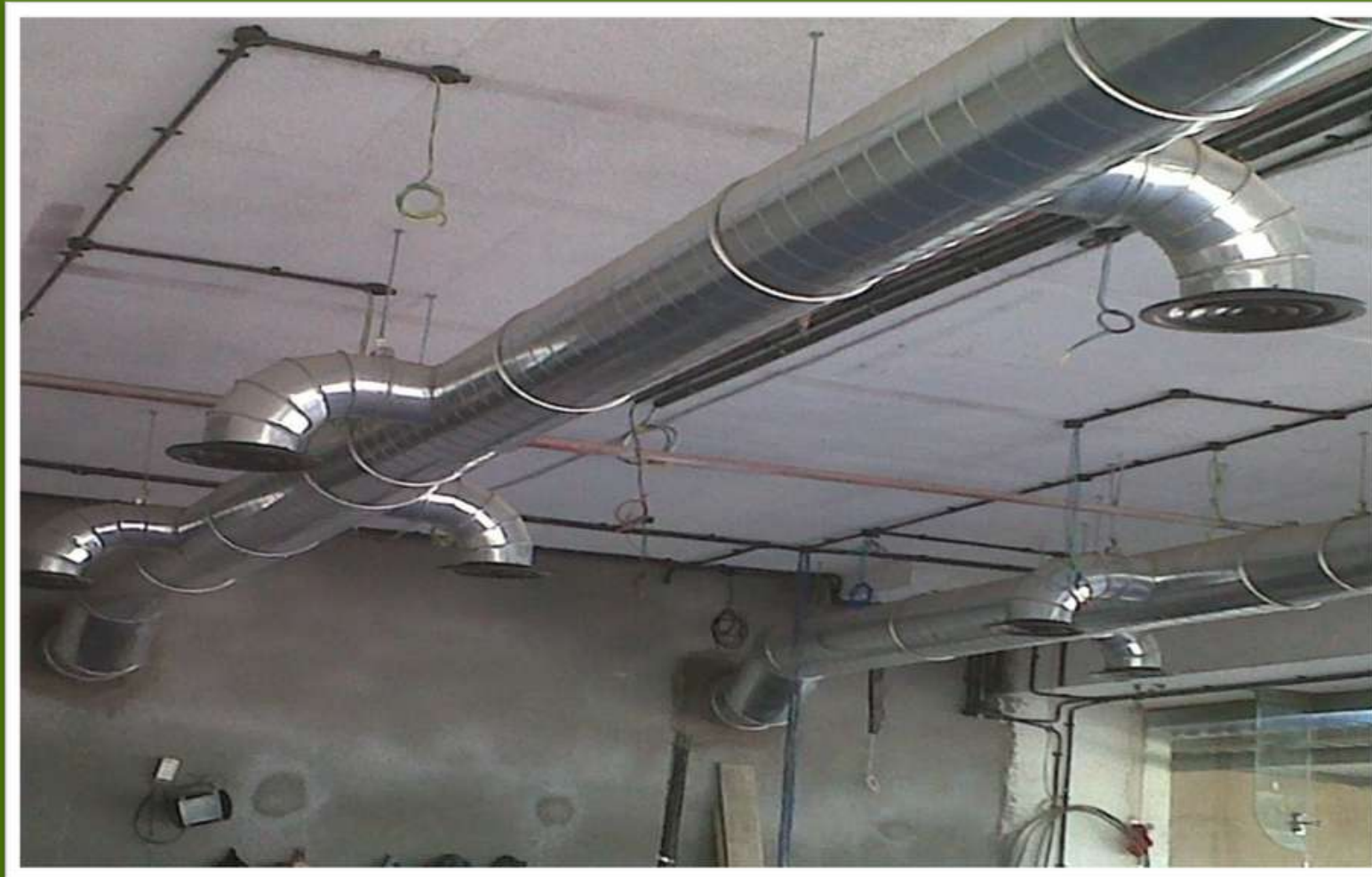
TORNADO RESTUARENT, Vashi